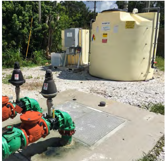
Alkagen AQ Solution provides fast-acting sulfide control

Alkagen AQ Solution is fast-acting and rapidly dissolves in wastewater, providing an almost instantaneous effect at the application point. This contrasts to magnesium hydroxide, which has to be added upstream to allow time for dissolution, sometimes requiring multiple feed sites.